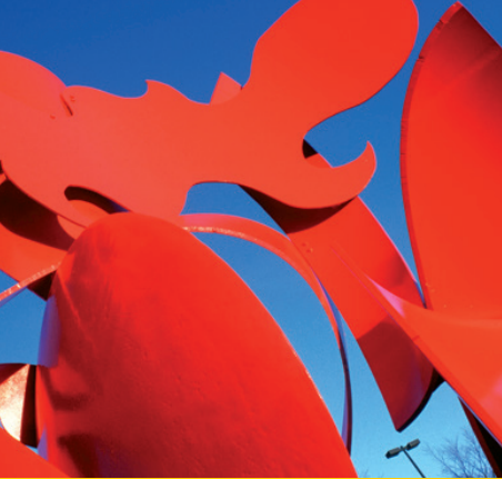
TOP L-R: COOLEY FOUNTAIN OUTSIDE THE MICHIGAN LEAGUE, BURTON TOWER, BEGOB, A SCULPTURE ON NORTH CAMPUS