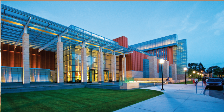
TOP L-R: NORTH CAMPUS SWINGS, ROSS SCHOOL OF BUSINESS, THE DIAG IN THE WINTER