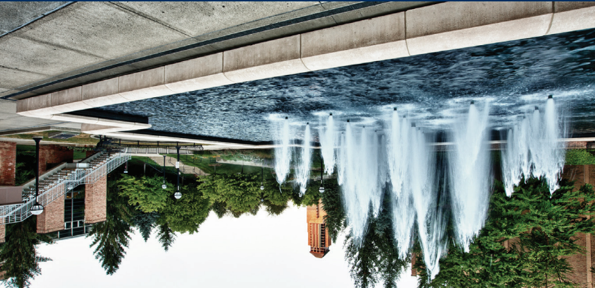
REFLECTION POOL, NORTH CAMPUS